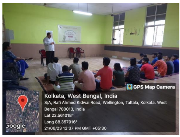
Some moments of International Yoga Day celebration, 2023